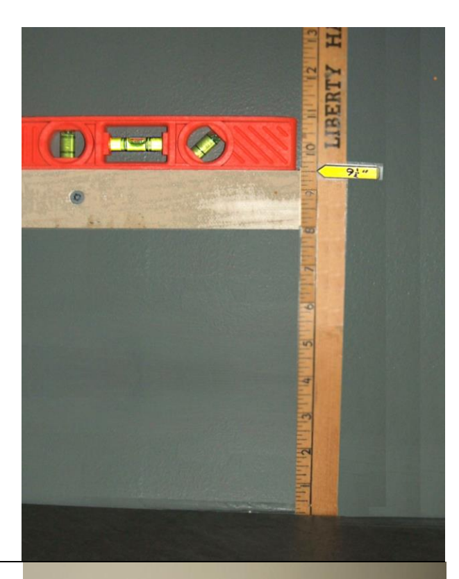
Photo Note: The yellow arrow is 9 ½" above the floor. The cabinet rests where the level is shown.